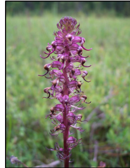
Close-up, Pedicularis groenlandica

The fen population of elephanthead lousewort on the project's western boundary was revisited on July 10, 2007 for a thorough count. Five hundred seventy-five plants were observed, and a little more than half of these were in late flower. This plant is represented by voucher specimen numbers MD06-369, MD06-381, MD07-016.